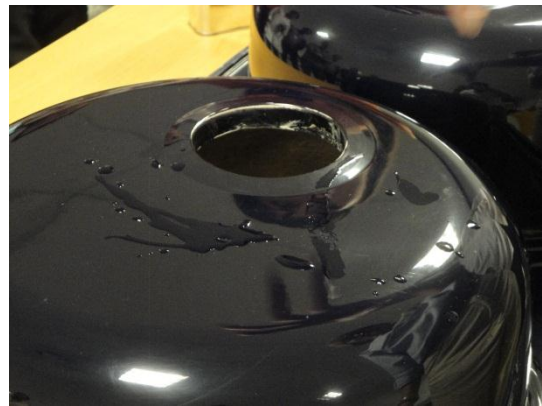
Water droplets that flattens out on the mold surface rather than forming a tight bead, indicate a cleaner surface.

In some cases even the tape test fails to uncover some surface residues, so another good double check is to drop a few beads of water or acetone on what you believe is a clean mold. If this beads up tightly like rain on a new umbrella or rain jacket, rather than immediately making a little pool, you will know that there are still some contaminants on the mold surface - keep cleaning.