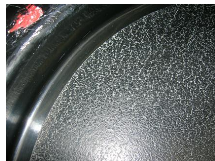
A mold with heavy styrene buildup in the non-skid areas.