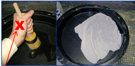
● Always use gloves! Covering molds can slow evaporation

4) Mold strippers like CW-10NC or CX-525 often require allowing the mold to sit for 15 minutes or more to permit the stripper to work. After scrubbing over the mold surface with stripper, covering the mold with cotton cloths that have been saturated with stripper will minimize evaporation and speed the stripping process.