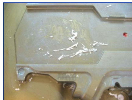
A mold with buildup from too much mold release